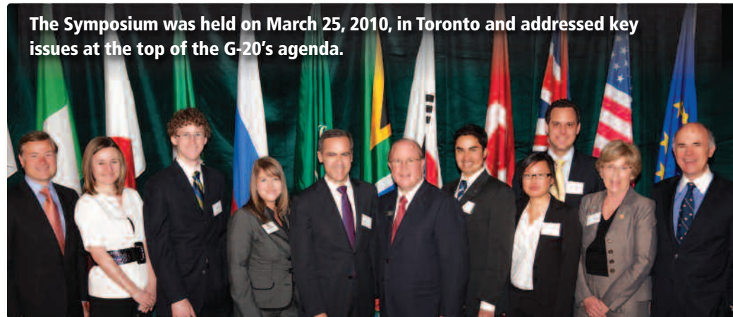
The Symposium was held on March 25, 2010, in Toronto and addressed key issues at the top of the G-20's agenda.