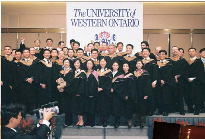
Congratulations! Hong Kong Executive MBA Class of 2004