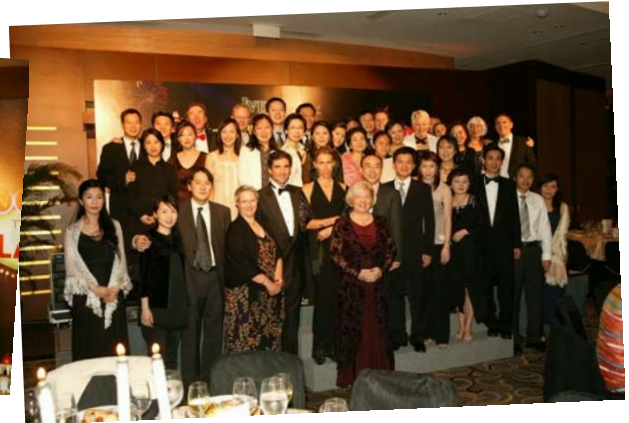
This year the Annual dinner in Hong Kong took on the theme of "Viva Las Vegas". 200 Ivey alumni, family and friends enjoyed an evening of fine food and great fun.