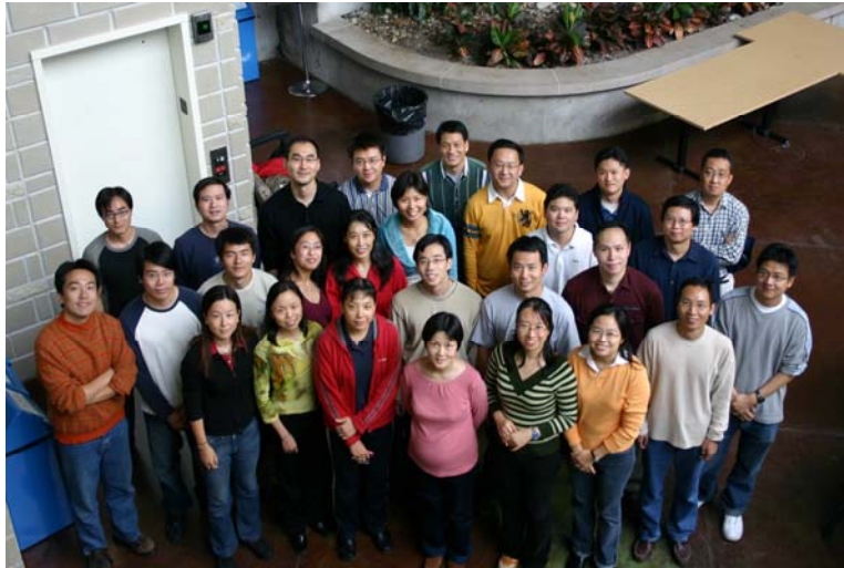
Gathering of Ivey Asian PhD candidates in the school's atrium.

For more details on research and publications by Ivey faculty and doctorals, visit www.ivey.uwo.ca/research/ and the online Refereed Abstract Database.