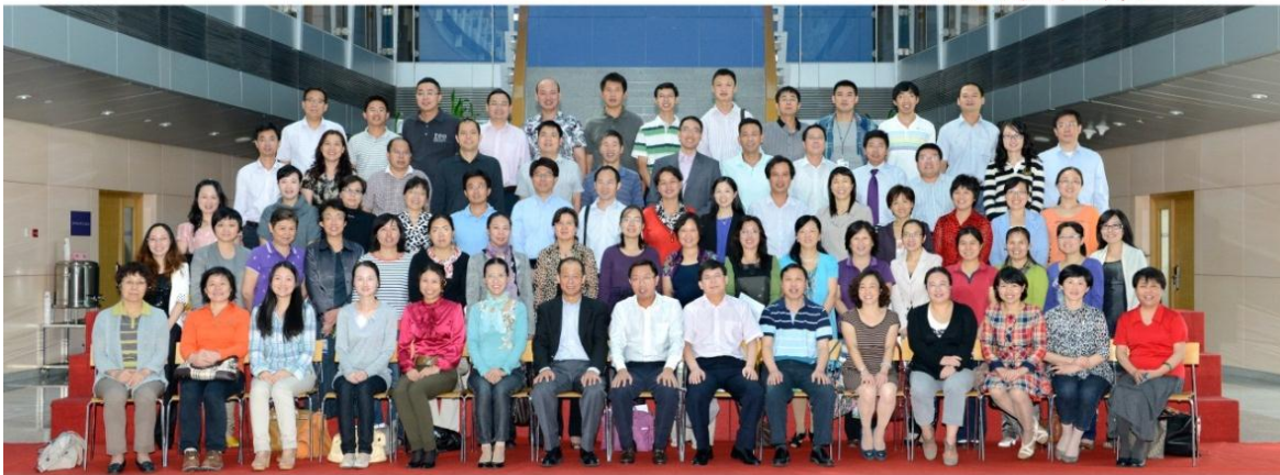
Beijing National Accounting Institute (BNAI) Case Teaching Workshop September 13 - 14, 2012