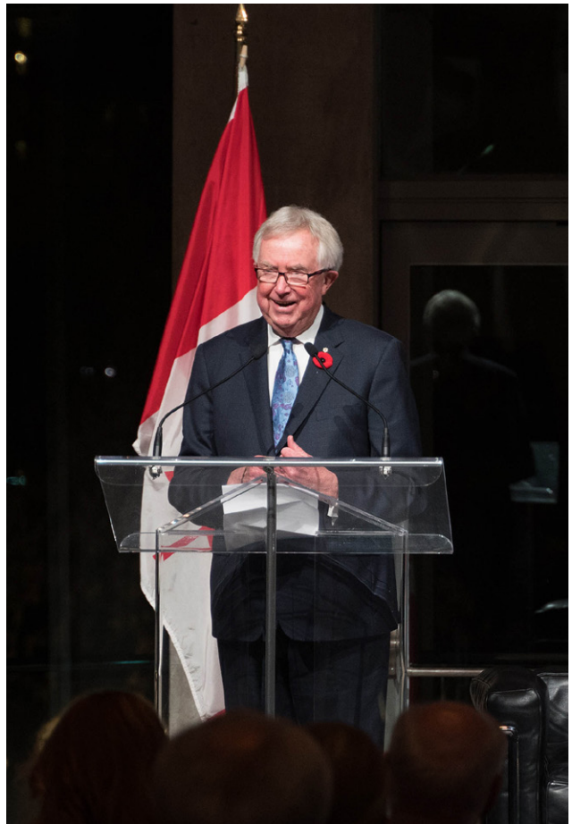
The Right Honourable Joe Clark