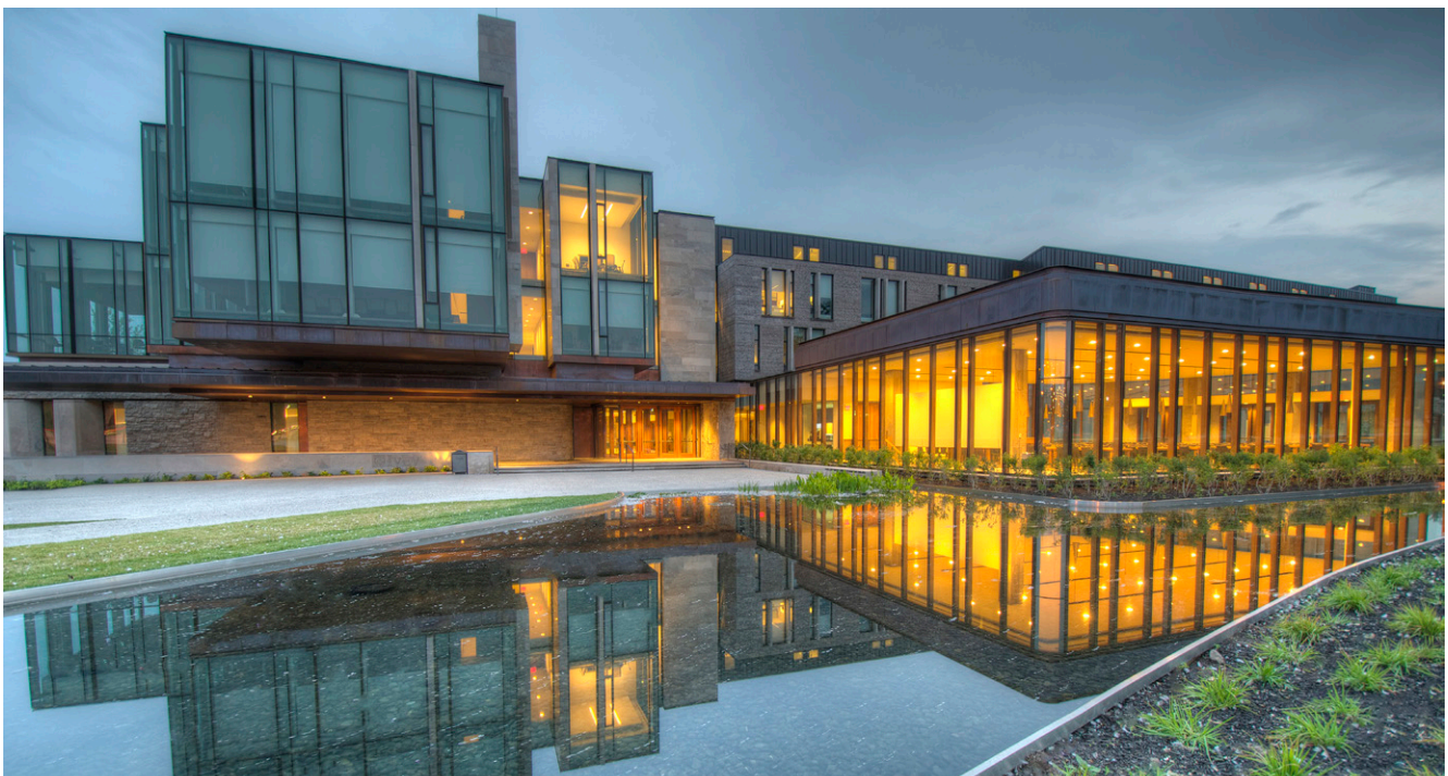
Richard Ivey Building, Ivey Business School at Western University, London, Ontario, Canada