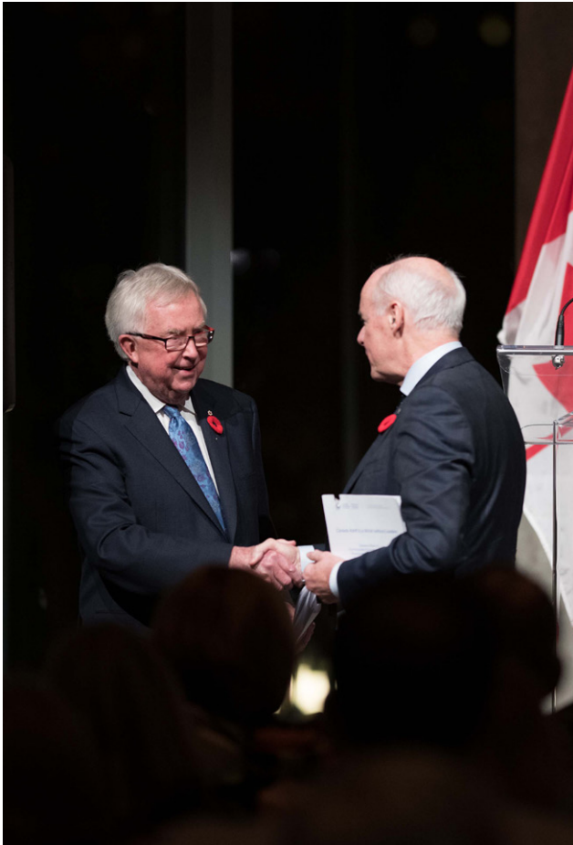
The Right Honourable Joe Clark and the Honourable Perrin Beatty

To take one random example: the smartest resource companies are investing in renewables and electrification and artificial intelligence as an instrument of innovation. An advantage, of course, is that business can also cancel a product line to finance an innovation while it is risky for governments to even talk about that. But this emerging circumstance creates a partnership, where the perspectives of “private” and “public” can come together, as they do forcefully in the example of Perrin Beatty.