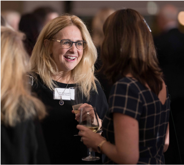
The Honourable Sheilah Martin