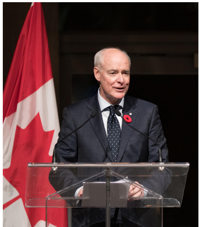
The Honourable Perrin Beatty

As has always been the case, repressive governments will take full advantage of technology to control their own