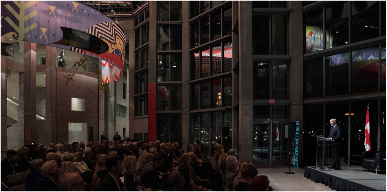
The Honourable Perrin Beatty

He knew that Reagan distrusted Nelson Mandela but he offered a blunt assessment of the opponents to majority rule. He said, “Ron, these people are Nazis. They’re on their way out, and the United States has to be on the right side of history.”