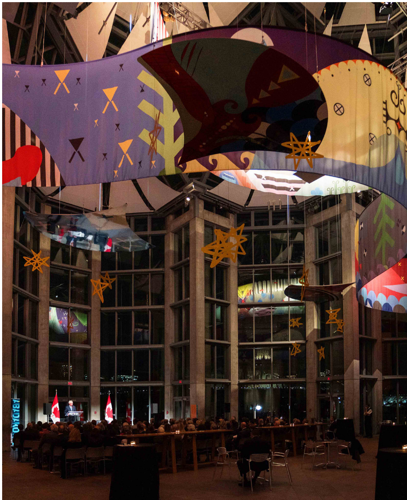
The Honourable Perrin Beatty delivers the Thomas d'Aquino Lecture on Leadership at the National Gallery of Canada in Ottawa, Ontario on November 6, 2019.