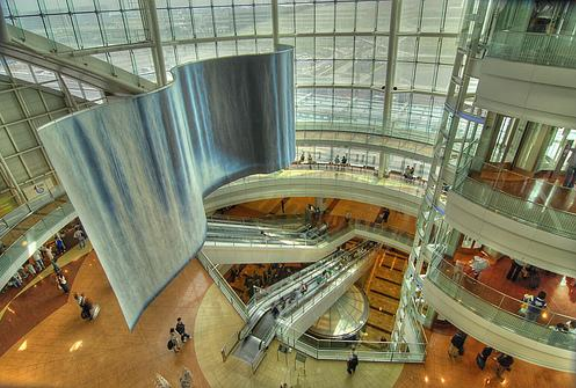
Tokyo's Haneda Airport: New Terminal Building