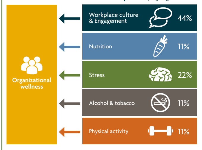
FIGURE 4: PRELIMINARY RESULTS (ORGANIZATIONAL WELLNESS INDEX SCORE % CHANGE FROM BEGINNING TO END OF STUDY)